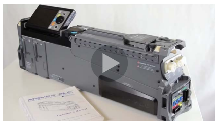
MOVES® SLC™ Training Video Full Version 30 mins

1. To work through this Maintenance Training Guide you will need to download the following: