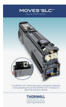
MOVES® SLC™ Quick Start Guide