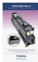
MOVES® SLC™ Quick Start Guide for Pre-Use System Tests

The checklist overleaf will guide you through the relevant maintenance and system test areas of the MOVES® SLC™ device.