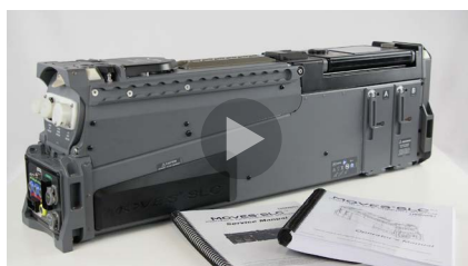
MOVES® SLC™ Maintenance Video

https://www.youtube.com/watch?v=-ZM2nONFKR8