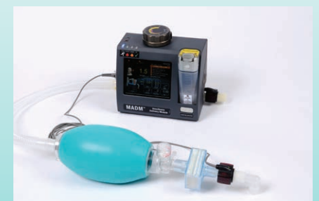
MADM™ with Resuscitator Bag