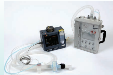
MADM™ with Transport Ventilator