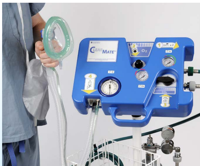
Improve the chances for survival by treating CO at the scene with ClearMate™. Portable. Lightweight. Rugged. It fits right in your vehicle!

When treating CO poisoning, every second counts. CO's high affinity for hemoglobin displaces oxygen, virtually asphyxiating the brain and other organs.