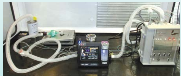
MADM™ with Transport Ventilator