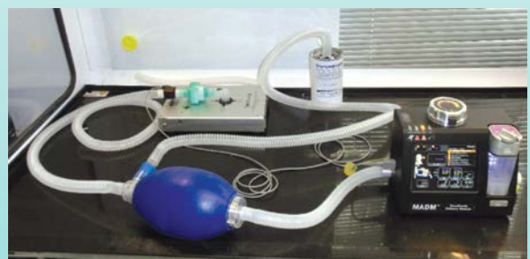
MADM™ with Resuscitator Bag