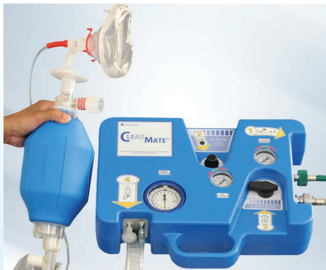
Improve the chances for survival by treating CO at the scene with ClearMate™. Portable. Lightweight. Rugged. It fits right in your vehicle!

When treating CO poisoning, every second counts. CO's high affinity for hemoglobin displaces oxygen, virtually asphyxiating the brain and other organs.